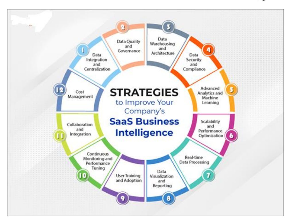
Fig 2: Saas Business Intelligence